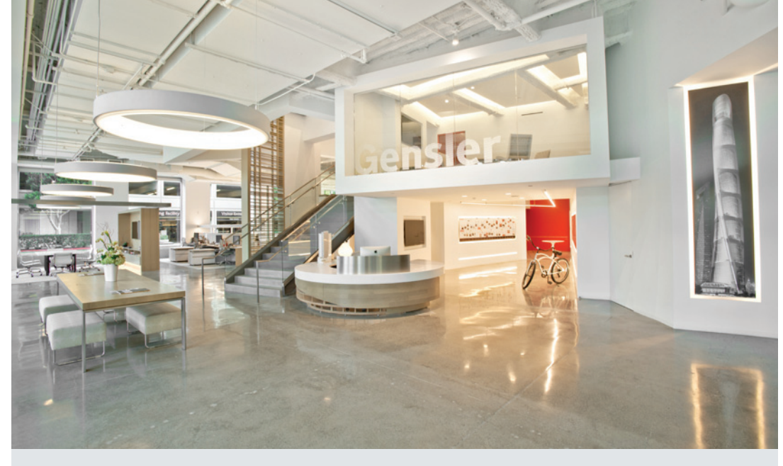
Gensler Offices Newport Beach, CA

Frameless glass office fronts foster collaboration, connectivity at Gensler Newport Beach